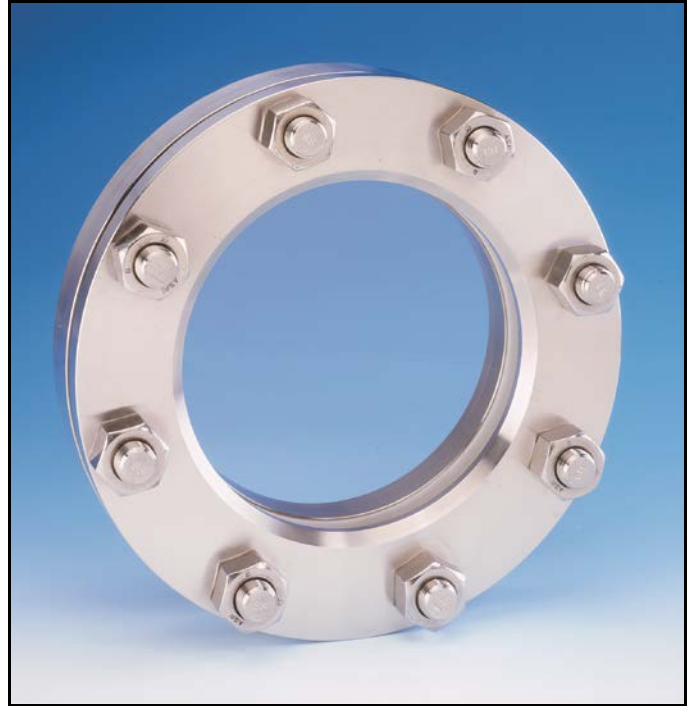
PAPAILIAS, Inc. Series NW Weld Pad Style Sight Glass